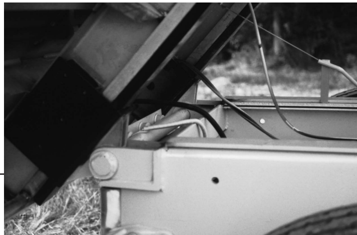
VTLW Rear Hinge